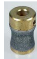
Gehrungsschleifer / Lamp bit, 19 mm 9°, 18°, 3/4"