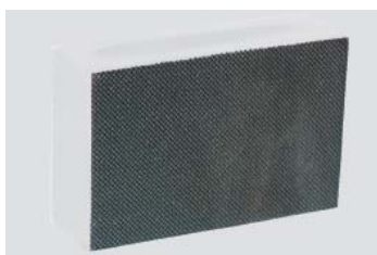
30 504 05 Diamant Schleifklotz 3M Diamond grinding pad 3M Weiß / white 700er Körnung / Grit