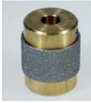
GLASTAR Schleifdorn, 25 mm Diamond bit, 1" 30 300 00 standard / standard 30 300 01 fein / fine