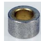
Schleifkopf, 16 mm, für Schleifmaschine G51 Diamond bit, 16 mm, for grinder G51