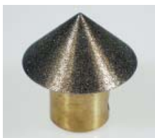
Entgrater / Deburrer, 35 mm