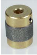
Schleifkopf / Diamond bit 1" = 25 mm