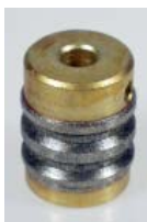
Spiegelschleifer / Mirror bit, 25 mm