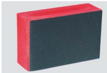
30 504 02 Diamant Schleifklotz 3M Diamond grinding pad 3M Rot / red 200er Körnung / Grit