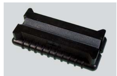
30 502 00 Carborundum Handentgrater (für 3 -15 mm Glass) Carborundum deburrer, (for 3 -15 mm glass)