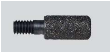
GLASTAR Schleifdorn, Standard Diamond bit, standard 30 306 00 6 mm / 1/4" 30 308 00 3 mm / 1/8"