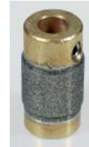
Schleifkopf / Diamond bit 5/8" = 16 mm