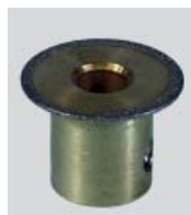
Rillenschleifer, diamant 25 mm, 1 mm Grooving bit, diamond 25 mm, 1 mm