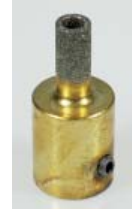
INLAND Hohl Schleifdorn, 6 mm Hollow diamond bit, 6 mm 30 406 00 standard / standard 30 406 01 fein / fine 30 406 03 speed / speed