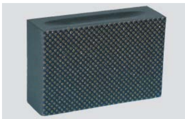
30 504 01 Diamant Schleifklotz 3M Diamond grinding pad 3M Schwarz / black 150er Körnung / Grit