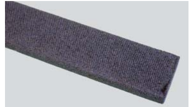
30 501 00 Carborundum Glasfeile, Carborundum glass file, 247 x 38 x 10 mm