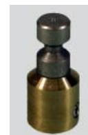
Spiegelschleifer / Mirror bit, 10 mm