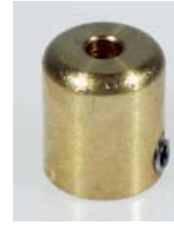
30 307 00 GLASTAR-Dornadapter für 1/4", 1/8" Adaptor for 1/4", 1/8"