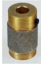
INLAND Schleifkopf, 19 mm Diamond bit, 3/4" 30 400 00 standard / standard 30 400 01 fein / fine 30 400 04 speed / speed 30 400 05 super / super 30 400 07 rippel / ripple 30 400 08 lampen / lamps 30 400 11 super speed